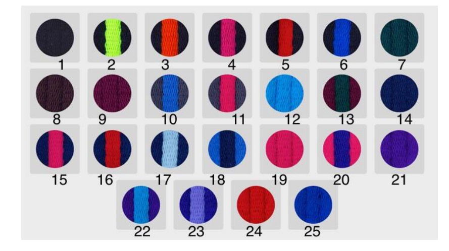
Kingfisher color is discontinued for leads and head harnesses